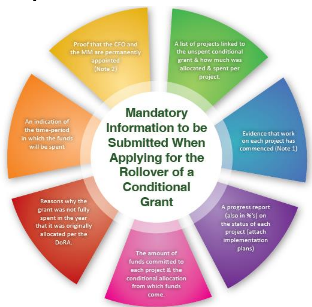
Note 1: Evidence that work on each project has commenced, applicable to the respective rollover, includes the following:

A formal letter addressed to the National Treasury requesting the rollover of unspent conditional grants in terms of Section 22(2) of the 2020 DoRA, which must be signed by the accounting officer;